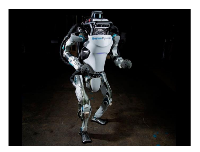
Figure 6 - Atlas Robot