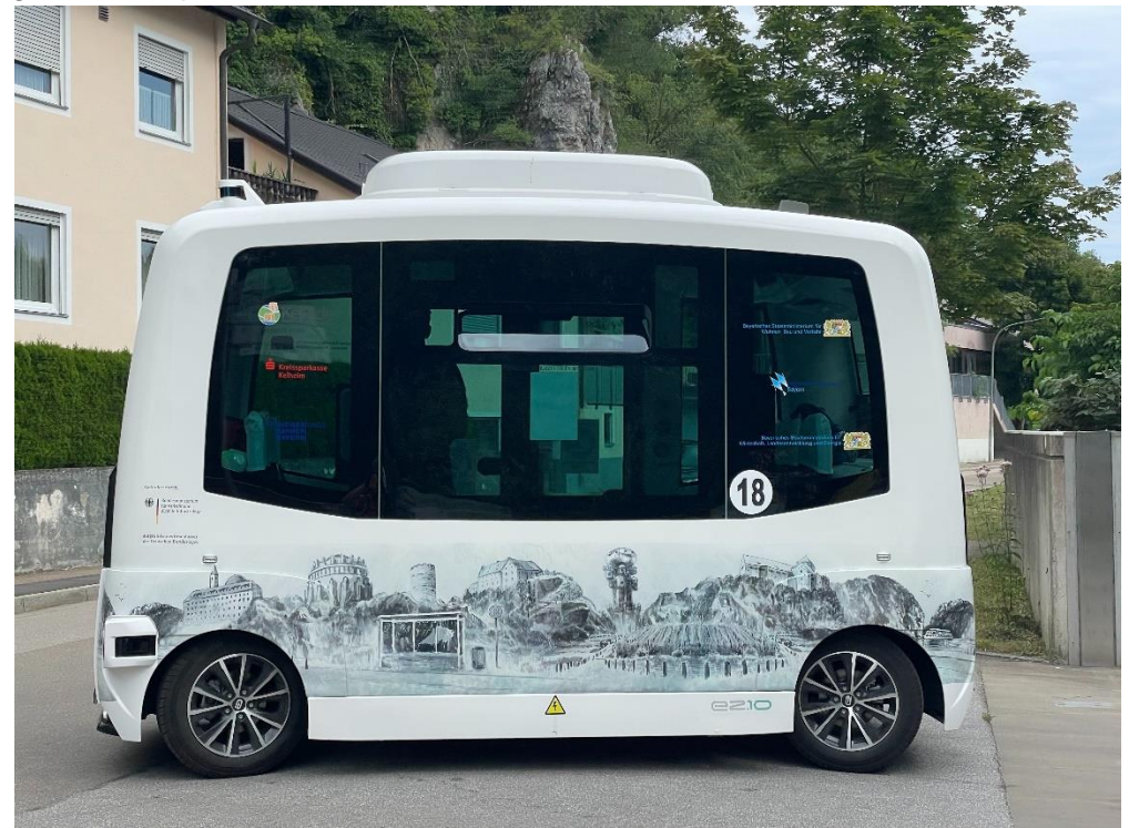
Figure 2 - Autonomous driving bus at the Weltenburg monastary in Bavaria, Germany

Autonomous driving: Self-driving cars use a variety of sensors to represent their environment and reasoning algorithms to plan safe routes and make decisions in real-time.