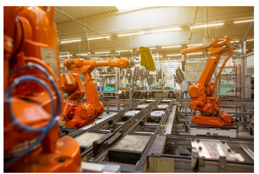
Figure 4 - Manufacturing Robots

Overall, natural interaction is a critical aspect of AI in physical robots, enabling humans to interact with machines in a more intuitive and natural way. By leveraging technologies such as natural language processing, speech recognition, and gesture recognition, physical robots can be designed to engage in natural, conversational interactions with humans, helping to improve efficiency, safety, and productivity in a wide range of industries.