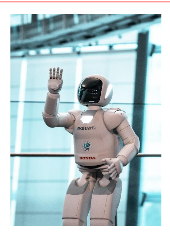
Figure 5 - Honda Asimo