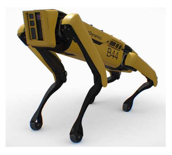
Figure 7- Spot Robot

Boston Dynamics' Spot is a four-legged robot that has gained a lot of attention for its impressive mobility and versatility. The robot is equipped with advanced AI technology that allows it to navigate complex environments, interact with humans, and perform a range of tasks. Spot has become a symbol of innovation in the field of robotics, showcasing the potential of AI in robotics and paving the way for new applications and advancements.