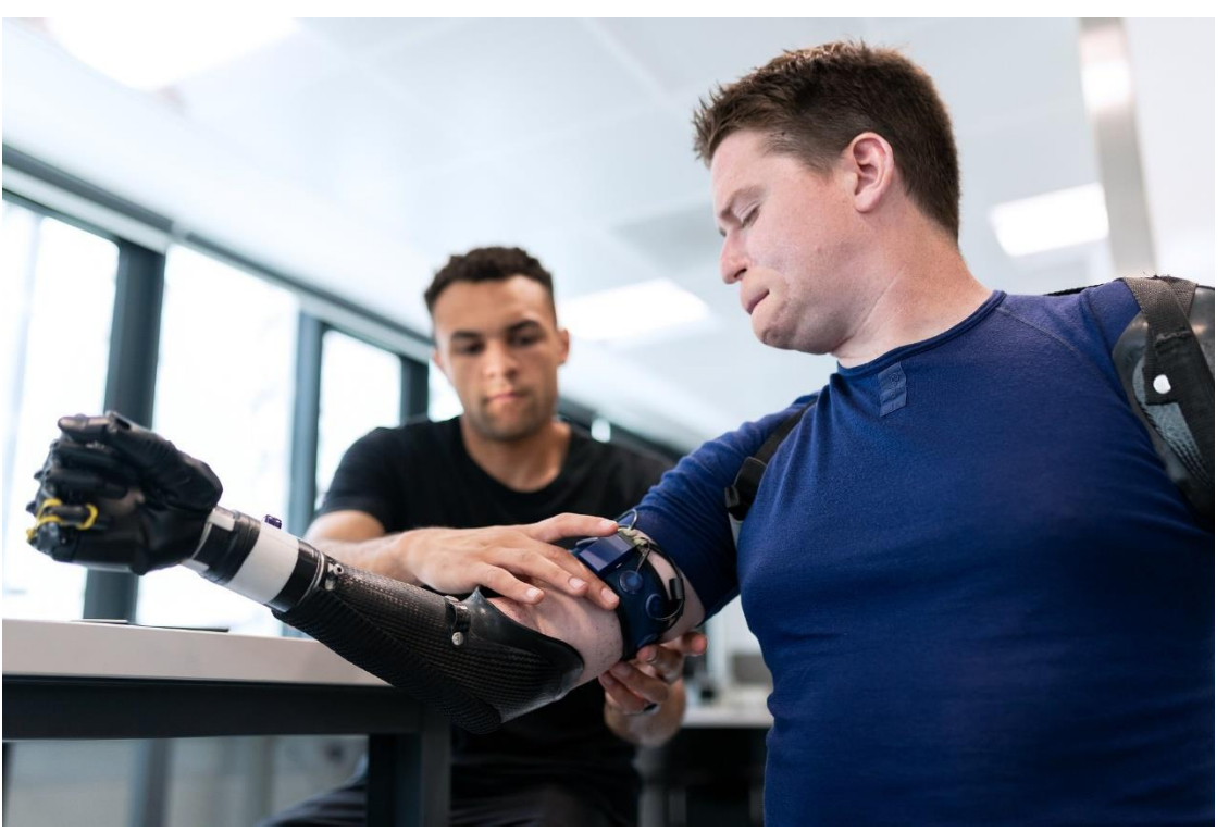
Figure 3 - Prosthetic Hand (Source - pixabay.com)

Humanoid Robots: Humanoid robots can be trained using imitation learning, allowing them to learn complex movements by observing and imitating humans.